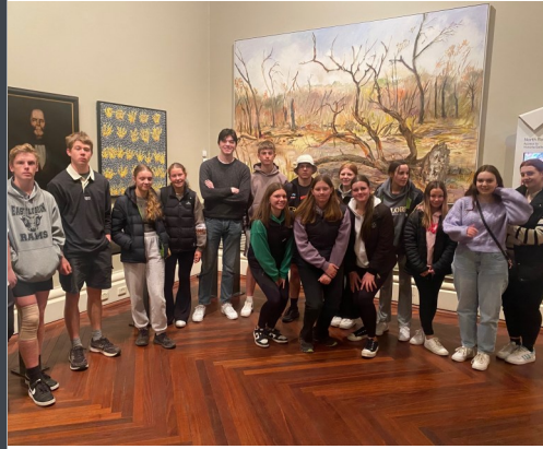
Also Marly's last carpool