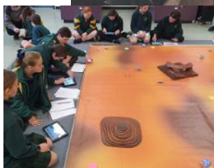
Right: Sphero robots on Mars