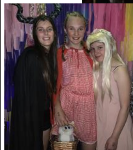
Year 8 Camp