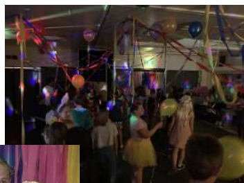
Middle Years Social